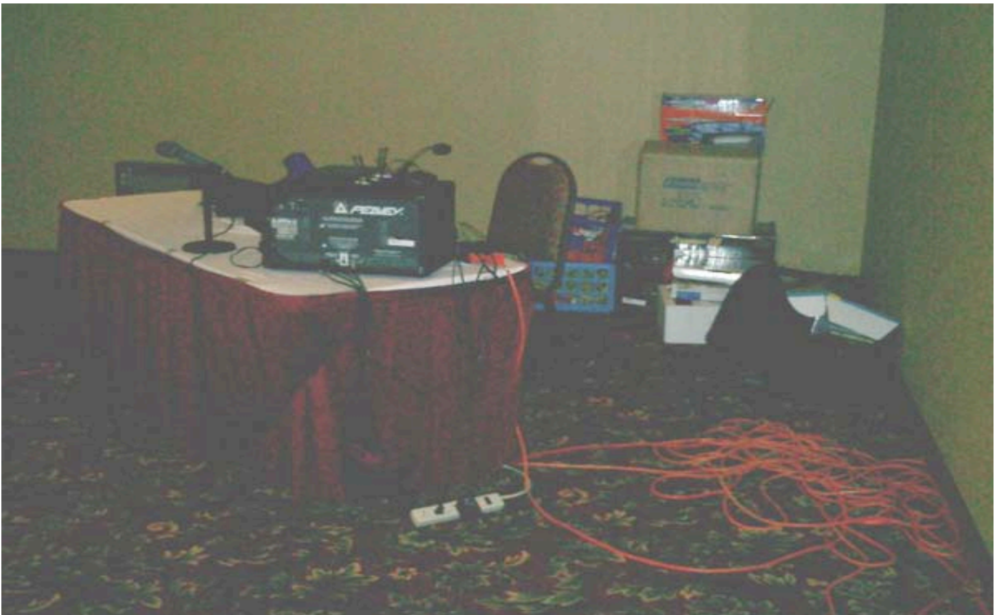
A TYPICAL NOVICE D.J. SET-UP