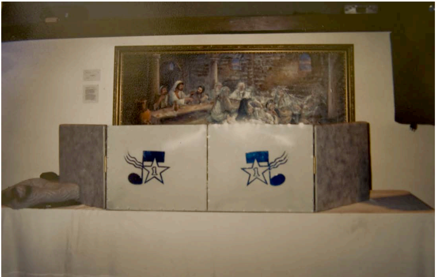
A TYPICAL AVERAGE D.J. SET-UP

Typical Price: $795 - $1,695 (but probably willing to negotiate just to "get the gig.")